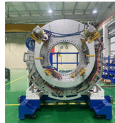
Left: design of the device; Right: a rotating Ring-shape gantry system by Huake Xianfeng